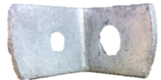
FXZ-AB711 (Model#: AB02H)