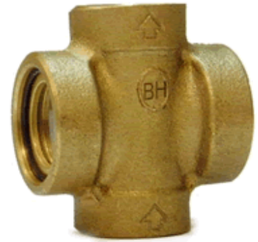
Model # BH-19