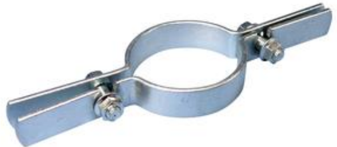
Model # RC01