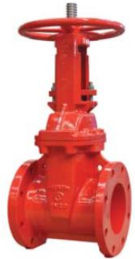
MODEL # ALOSY3-FF