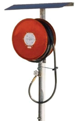
Can also be supplied with a sun shield (FFS-HRS-SS)

You specify the OD size required & We cut to your required height