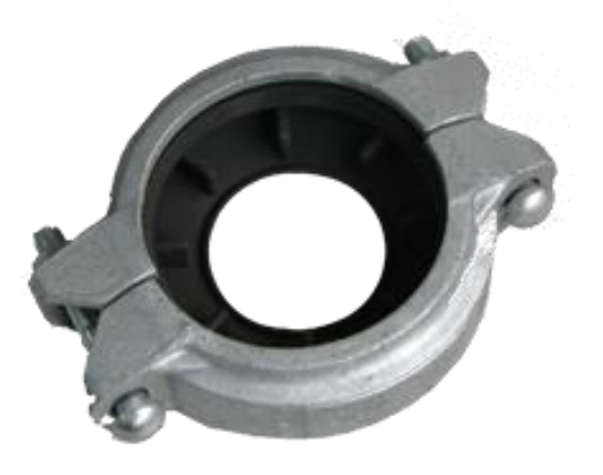
Model # GT-402A