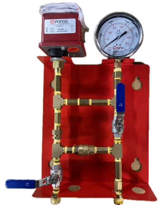
Complete with mounting board